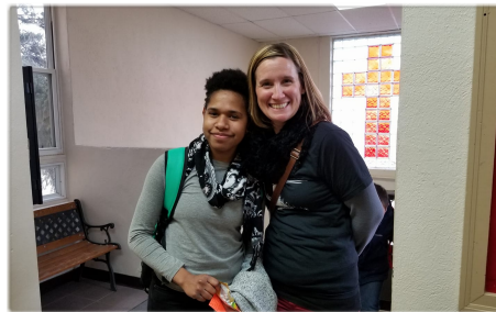
Miller, SD At Sunshine Bible Academy's first ever Mission Conference, we met a lot of bright students, including one from Papua New Guinea.

Finished the 1st weeks of our summer season. At East Iowa Bible Camp we saw our largest response ever, both to the Gospel and the challenge of missions.